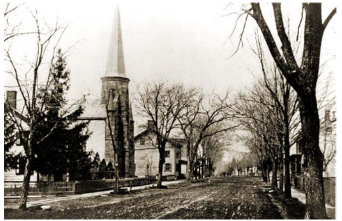
C1891

membership was growing and the church was thriving. The minister’s salary was now $1000 a year with an extra $50 for keeping his horse!