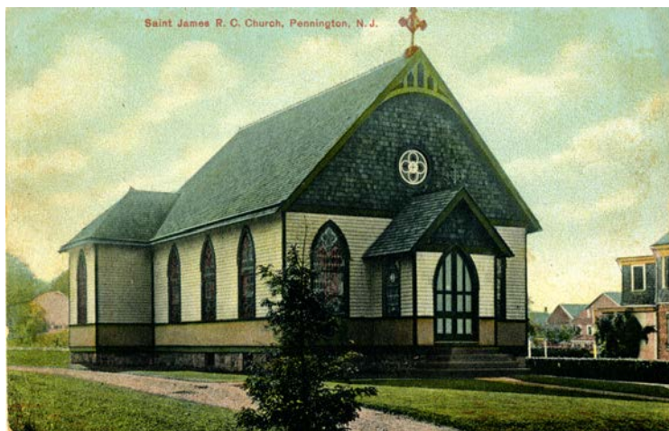
C1910