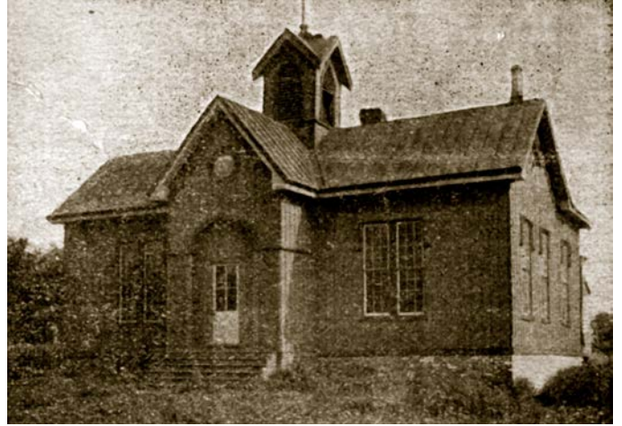
C1910